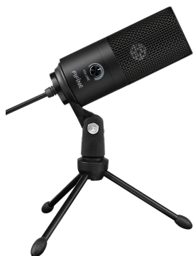
USB Microphone: $29.99