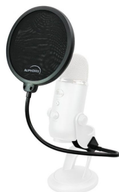
Pop Filter: $20