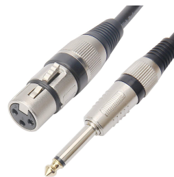
Microphone Cable: $15 (per cord)