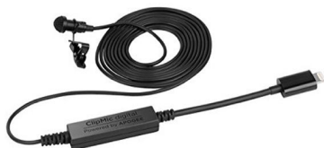
Lavalier Microphone: $200