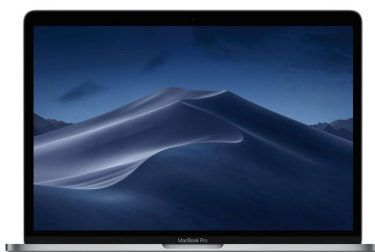
Macbook Pro: $2,099