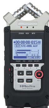
Field Recorder: $220