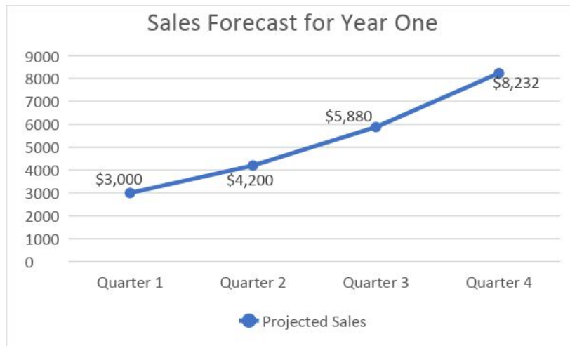
Figure 6: Sales Forecast for Year One